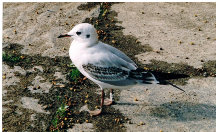
A young Black Headed Gull - 2A92 - which was ringed June 2004 at Lake 9 as a chick and sighted in Cheshire September 2004